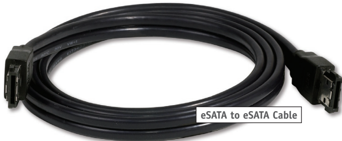
eSATA to eSATA Cable