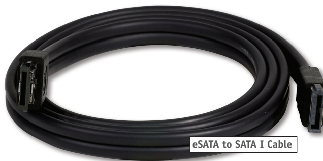
eSATA to SATA I Cable